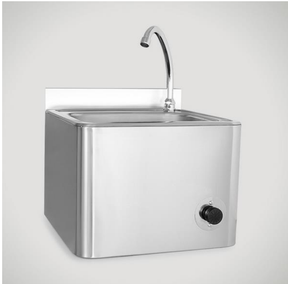
Handwashing basins Wall-mounted handwash basins